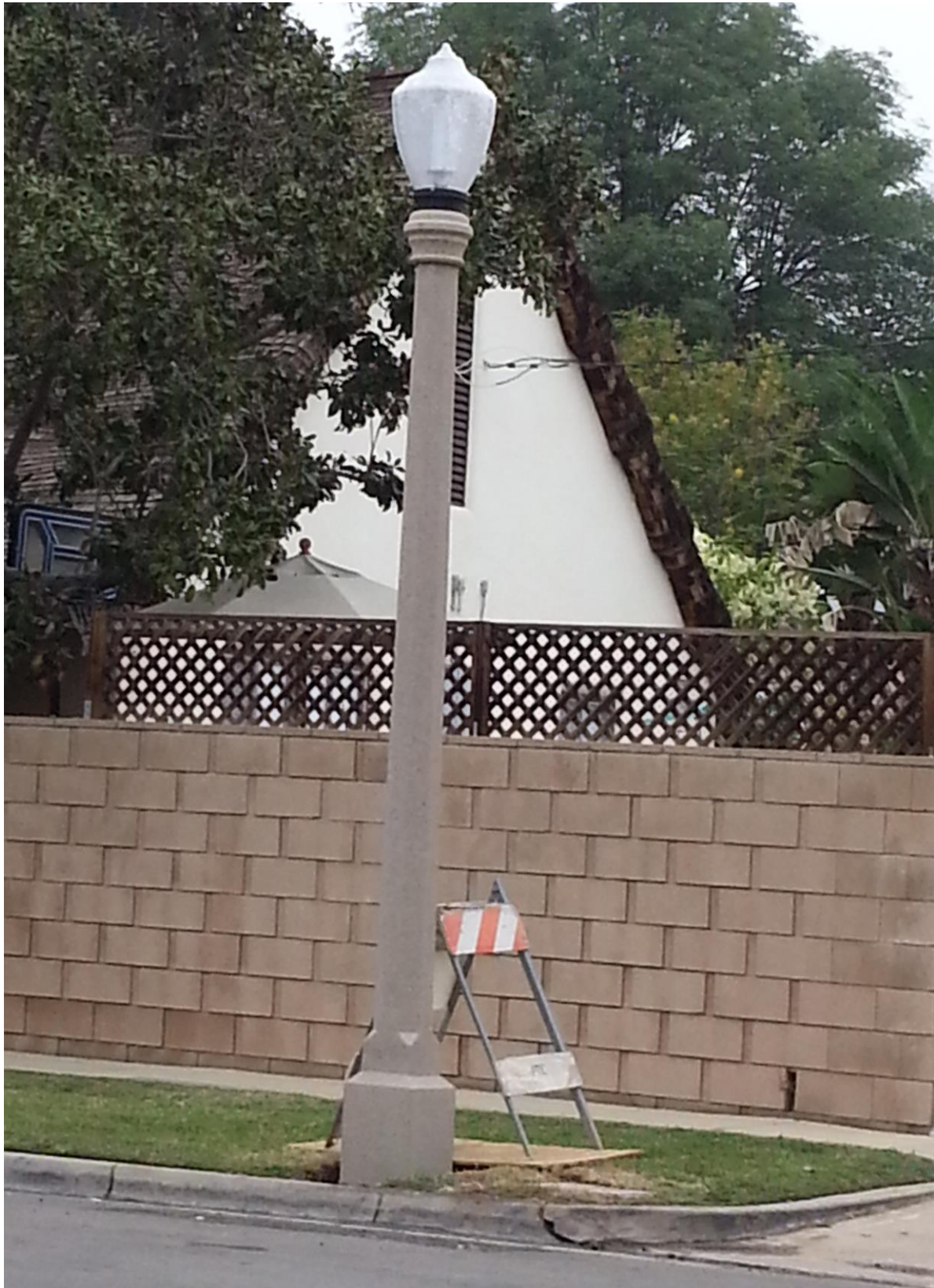
EXHIBIT 1 - Wood Streets Lighting Update