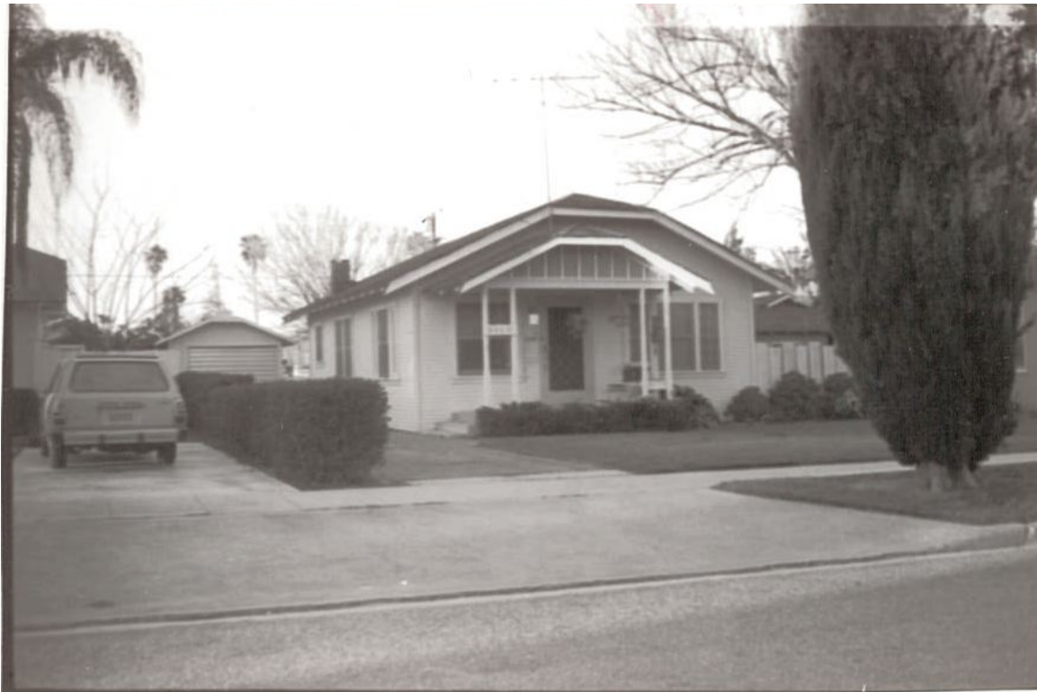
3968 Rosewood Place, 1979 survey