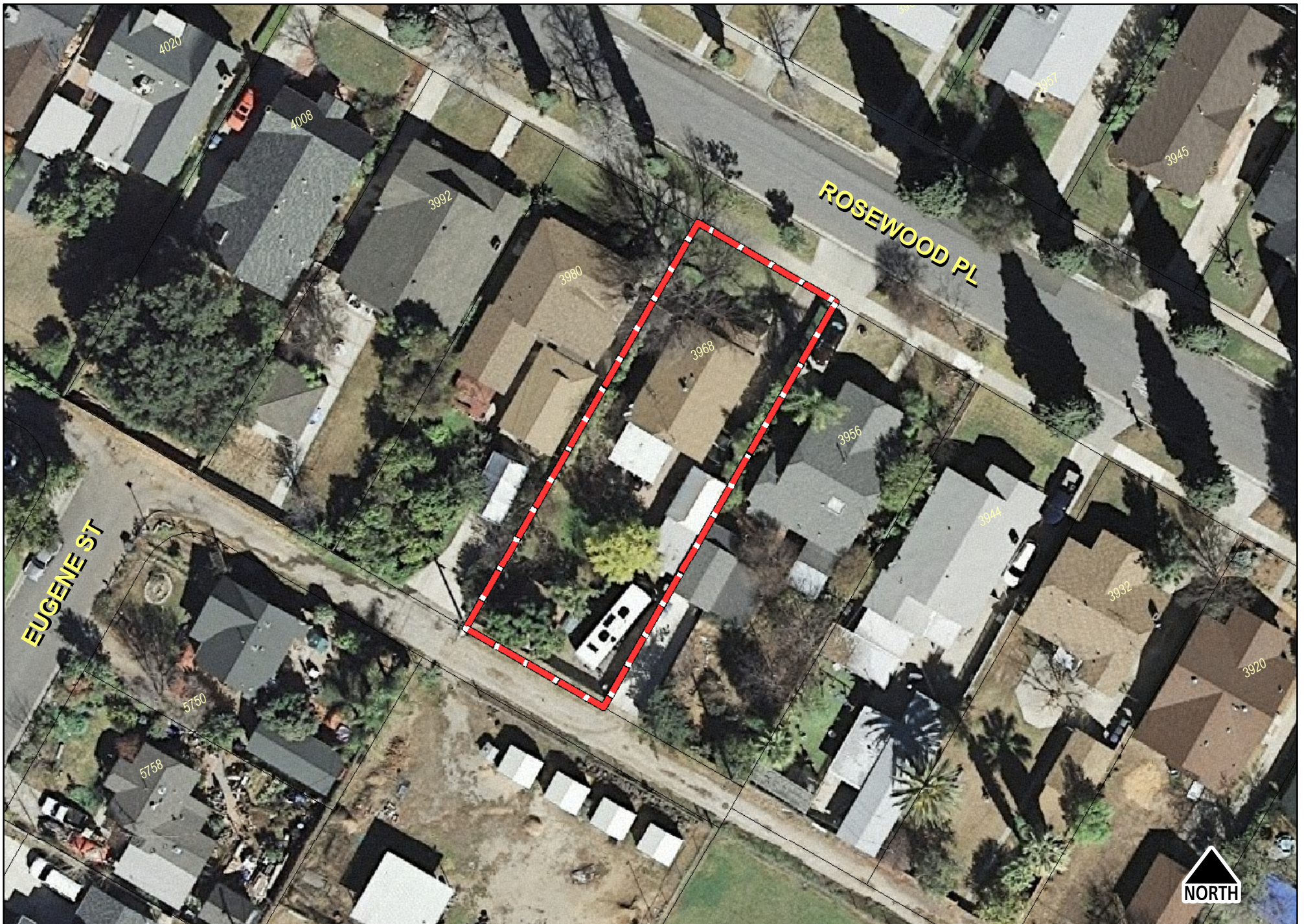
P13-0353, Exhibit 2 - 2012 Aerial Photo