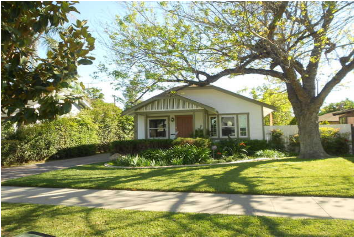
3968 Rosewood Place, 2013