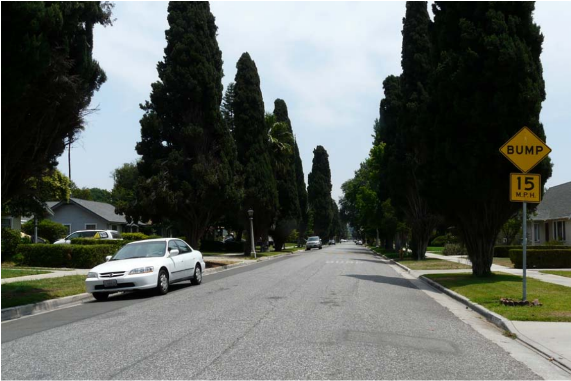
Rosewood Place in Wood Streets NCA