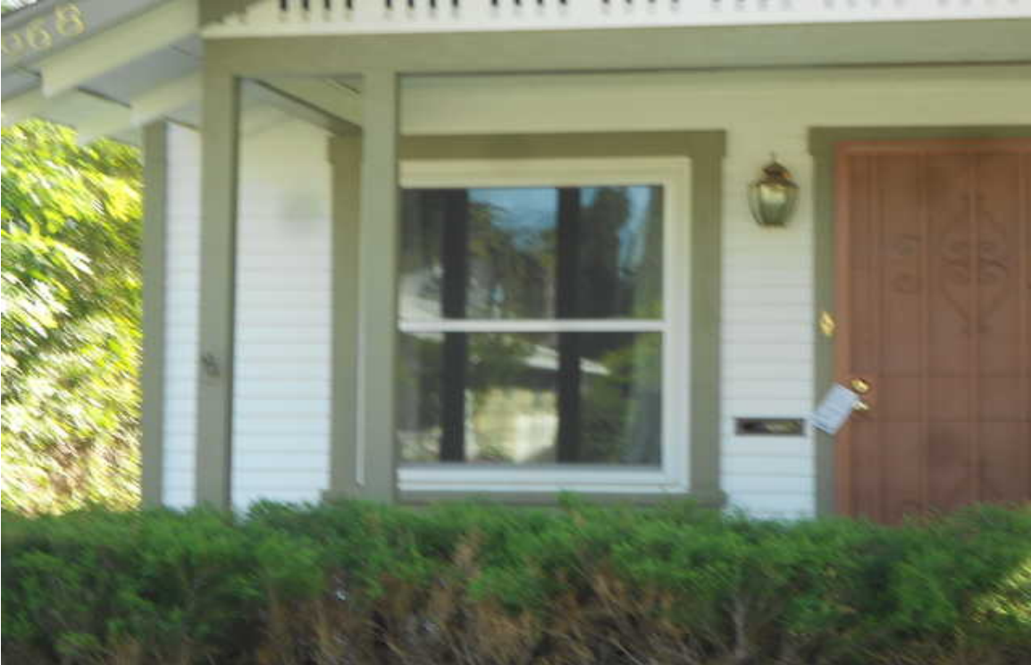
Window left of front door