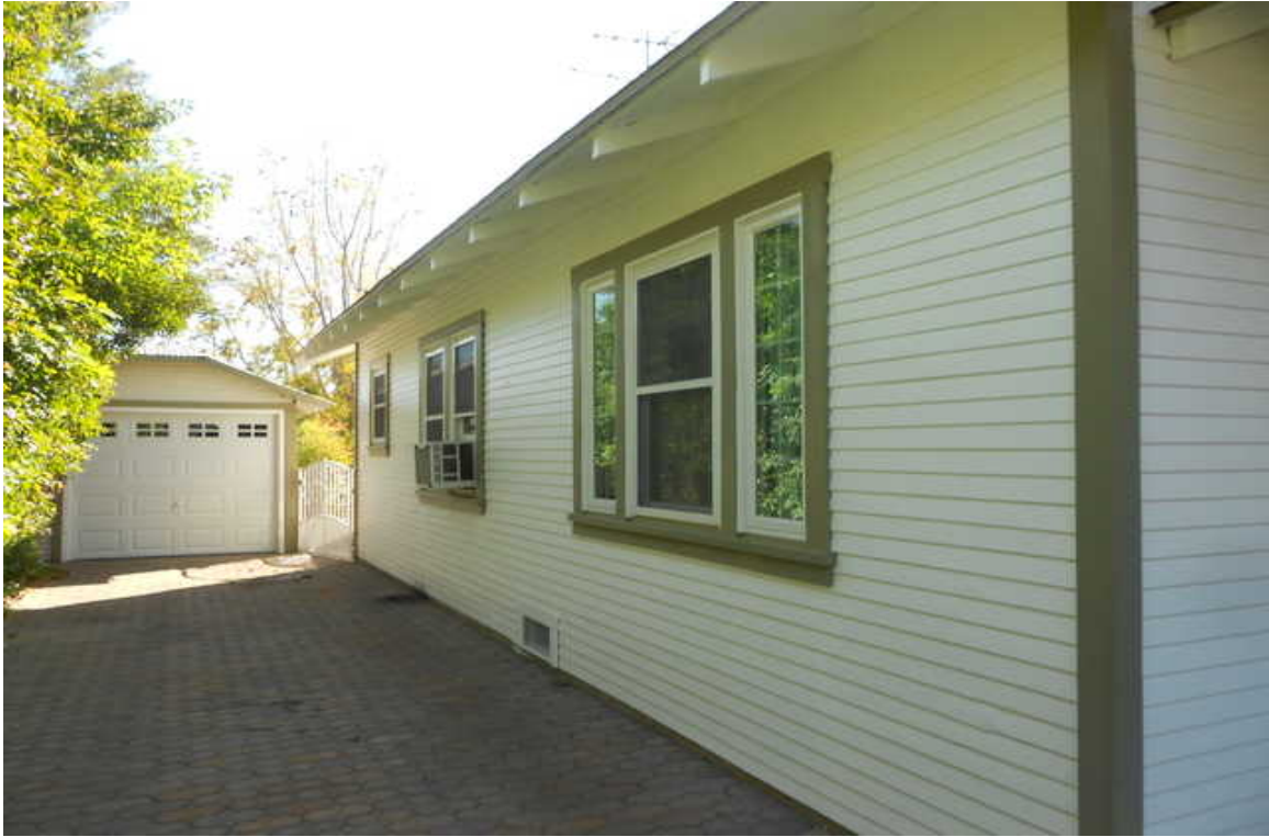
Left side of home