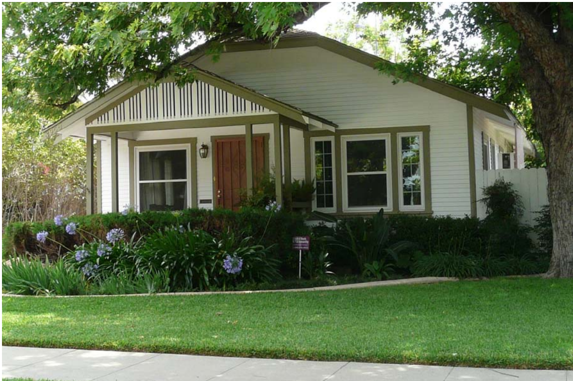
3968 Rosewood Place, 2013