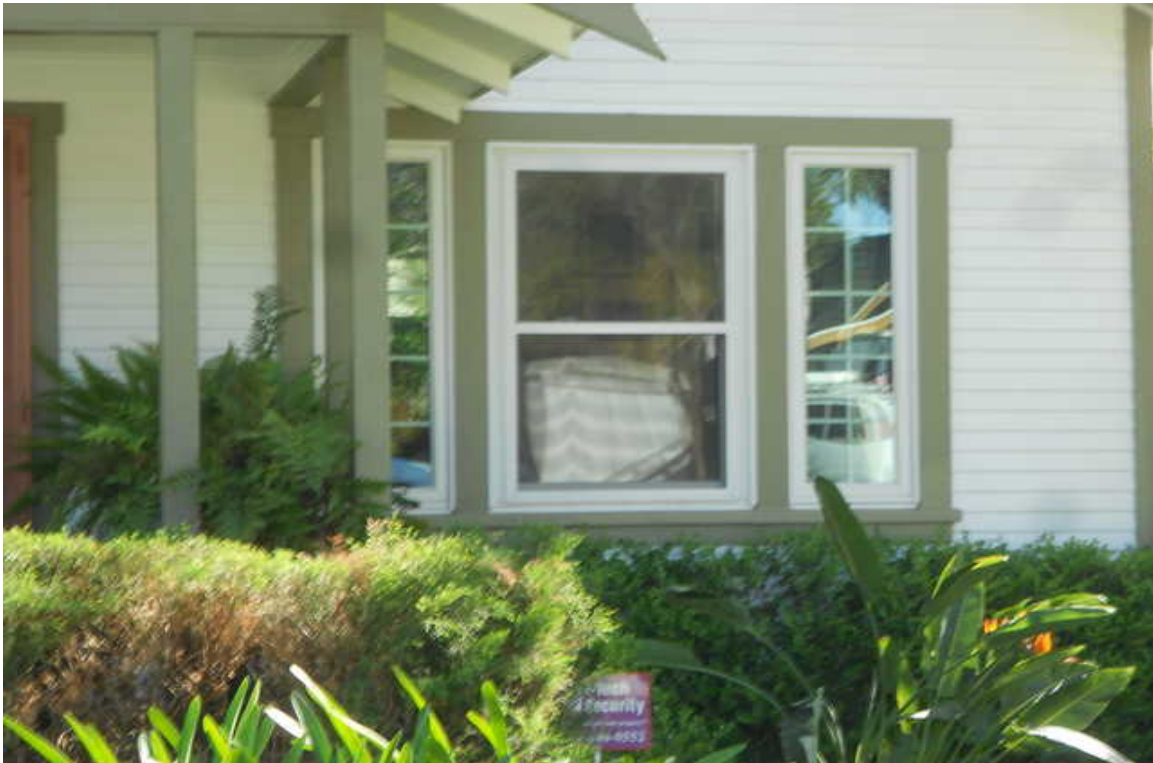
Window right of front door