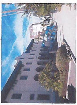
LOCATION OF MUSEUM