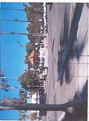
LOCATION OF CHINESE PAVILLION