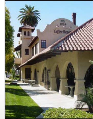
Recognizable architectural styles such as the Mission Revival Style Union Pacific Train Station provide visual interest and identity.

Riverside's rich architectural history is evident in buildings throughout the City. The Pueblo Revival Style of the City's Santa Fe train station illustrates how diverse and creative architectural styles can be.