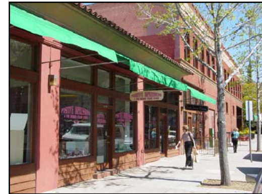
Preserved storefront retains historic and architectural character and pedestrian orientation.

Design guidelines relating to historic buildings may also be found in area specific plans.