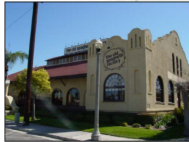
Original Mission Revival style industrial warehouse converted into restaurant use. Historic Mission features are preserved.

The Secretary of the Interior's Standards for the Rehabilitation of Historic Buildings are available on the Internet website of the National Parks Service at www.cr.nps.gov