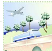
Figure N-8 (2025 Riverside and Flabob Airport Noise) focuses on noise impacts projected for these small facilities by the Riverside County Airport Land Use Commission. Figure N-9 indicates future noise levels associated with March Air Reserve Base/March Inland Port as projected in a 1998 Air Installation Compatible Use Zone Study completed by the Department of the Air Force.

The Land Use Policy Map (Figure LU-9 in the Land Use and Urban Design Element) has been developed to avoid placing intensive new uses with the airport-influenced areas. These policies are carried out through congruent zoning regulations. Development controls include limiting development within areas subject to high noise levels and limiting the intensity and height of development within aircraft hazard zones. The Riverside County Airport Land Use Compatibility Plan (CLUP), proposed for adoption in 2005 by the Riverside County Airport Land Use Commission, proposes to designate zones of airport-influenced areas for every airport in Riverside County and proposes a series of policies and compatibility criteria to ensure that both aviation uses and surrounding areas may continue.