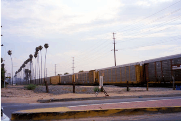
New technologies are being explored to improve roadway-rail grade crossings in Riverside.

growth. With its extensive network of freight trains and the growing popularity of commuter rail operations, Southern California as a region incurs train-related incidents at a disproportionately high rate.