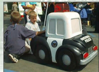
Riverside is aware that public safety education can start at a young age.

Educating residents and businesses about potential disasters and the Emergency Operations Plan can increase the effectiveness of response efforts. An educated public will know how to prevent injury and property damage during and after emergency events and also know how to find and offer help to their neighbors. The City will work to educate residents and businesses about appropriate actions to safeguard life and property during and after emergencies. Education about emergency preparedness can occur through the distribution of