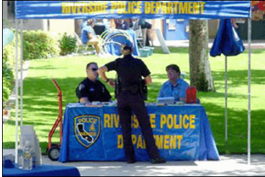
The Police Department is heavily involved in the community.

The Police Department has recognized that this centralized form of organization does not optimize response nor create the desired proactive police presence throughout the community. The Department has made the decision to create a decentralized, precinct-based organization to provide more equitable and responsive services across the City. This reorganization shifts from a single station to a decentralized structure that moves department operations to four precinct stations. A precinct-based system will permanently assign officers to certain districts of the City, enabling officers to gain a better understanding of that particular areas of the community – and for the community to become more familiar with the officers assigned to them. This method of policing, also known as community policing, balances reactive responses to calls for service with proactive problem-solving in an effort to keep crime incidences from occurring.